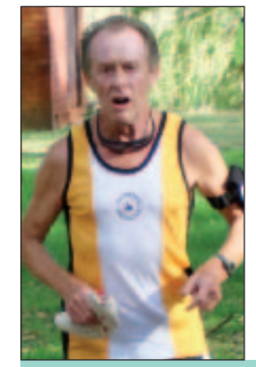
In My View by the Editor

But what about the bloke? He looks gaunt, granted; a lot like most of our runners. But his alter ego is a fat git, with