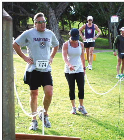
Body language – translates as 'Not happy, John!'