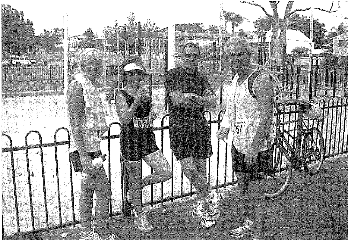
Relaxing after the Pleasant Run